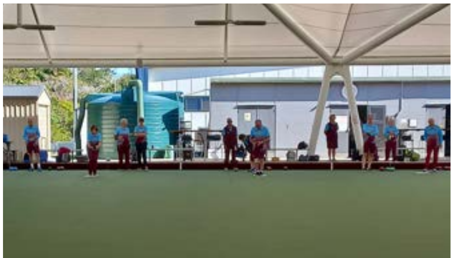
The bell sounded and the battles (games) began.