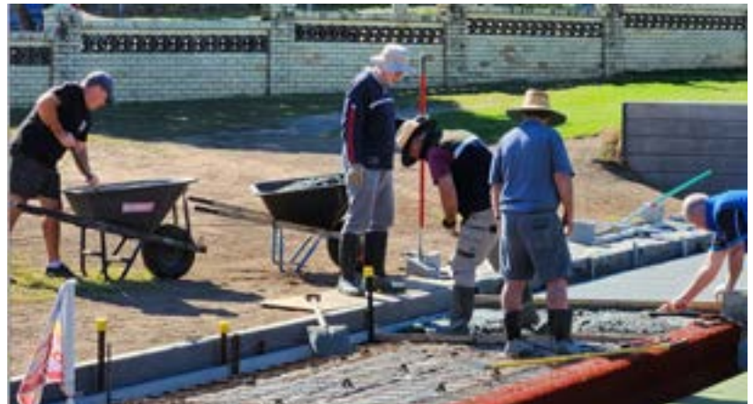
Volunteers are the backbone of the Club.