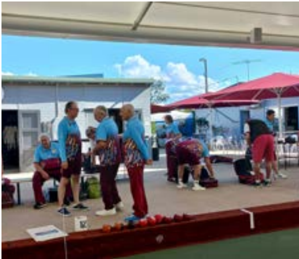
Were the boys discussing the weather or team tactics?