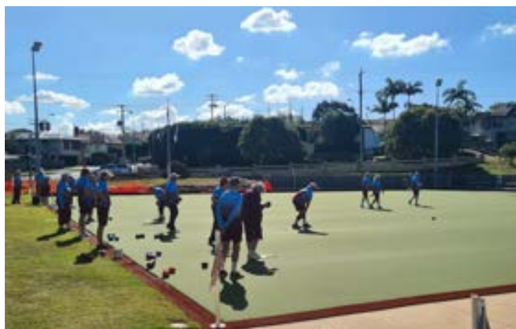
Mother Nature turned on a glorious day for all in attendance.