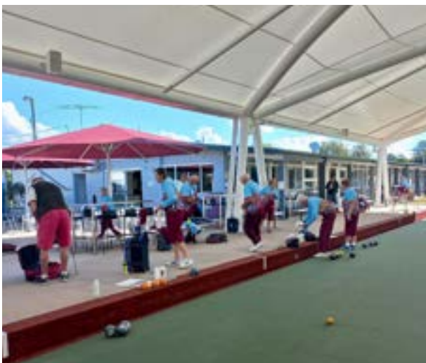
Getting ready for the game ahead.