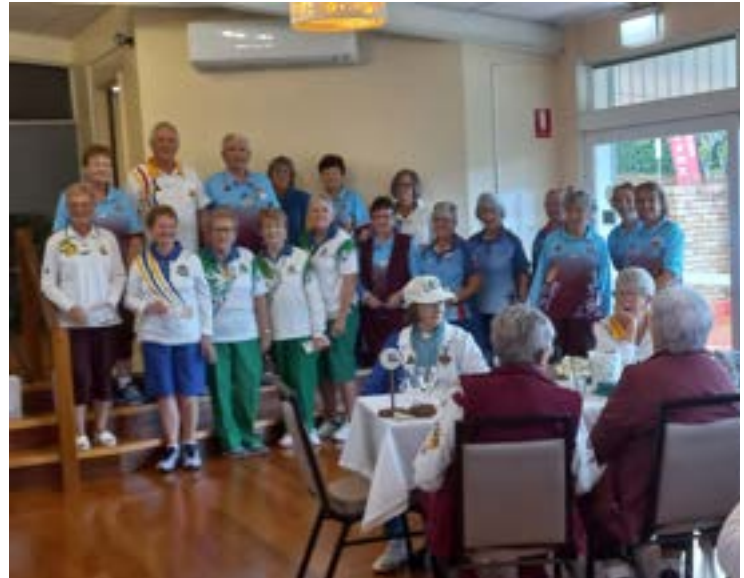
All the 'Out of the Hat' prize winners.