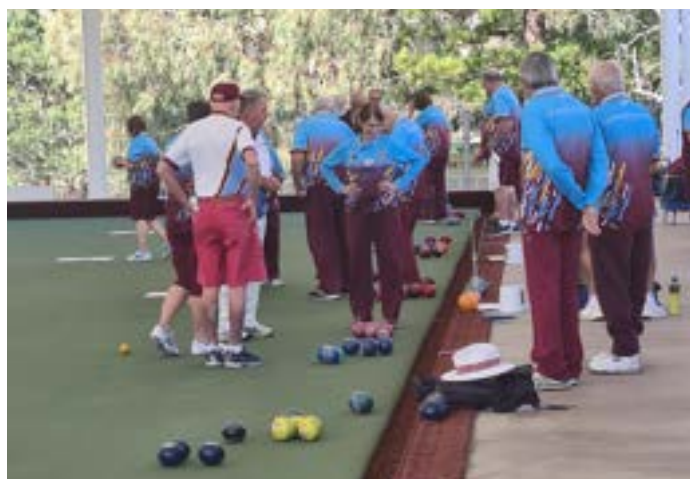
All smiles and team tactics discussions at the beginning of the day's play.