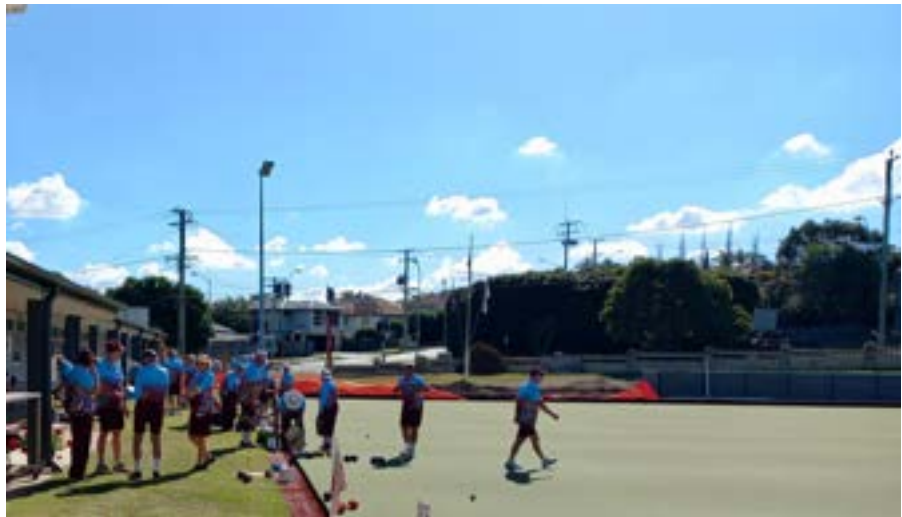
Not all of the action was undercover. With so many teams competing some games had to be played outside..