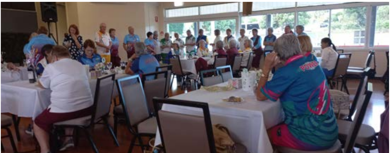
Some of the day's participants, eagerly awaiting the 'Out of the Hat' draw.