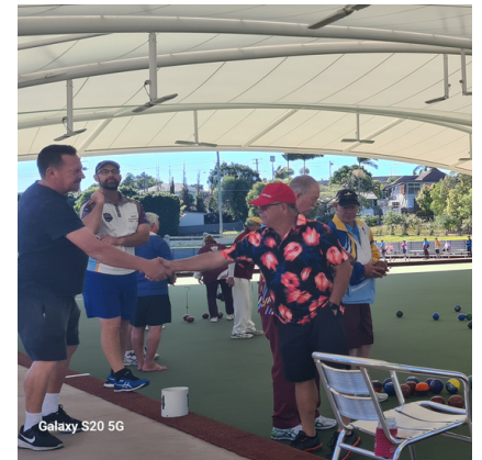
Action shots from across the day - and a handshake for a game well played