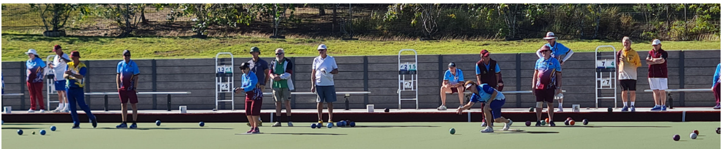
The wonderful weather provided for a fantastic turnout

Many great raffle prizes were drawn hourly throughout the day.