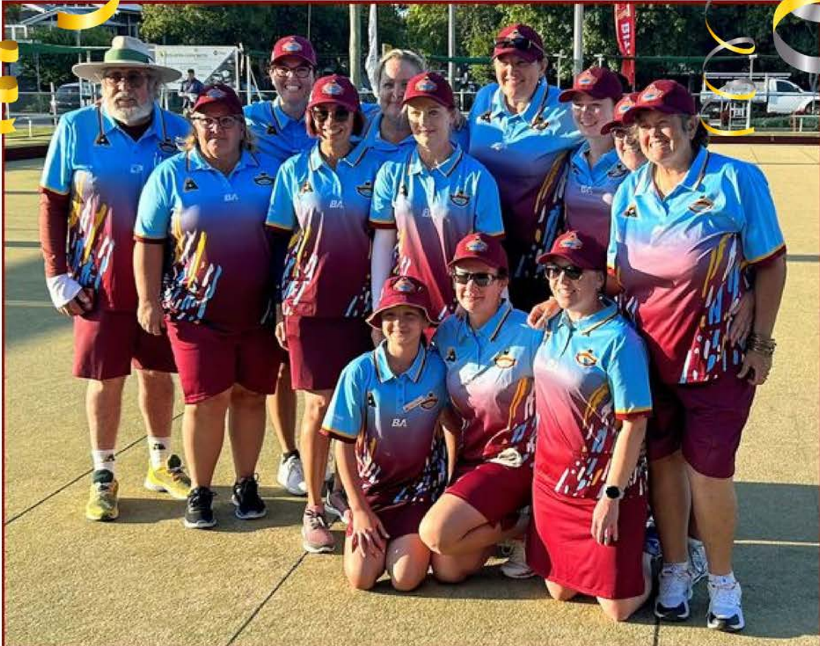
2023 Ladies Group 4 Division 1 Pennant Playoff Winners ( Northern Suburbs )

A big day for this amazing group of ladies winning the Ladies Zone (Group 4) Div. 1 Pennant playoffs last Sunday against two tough competitors in Pine Rivers (Moreton Bay District) and Kawana (Sunshine Coast District).